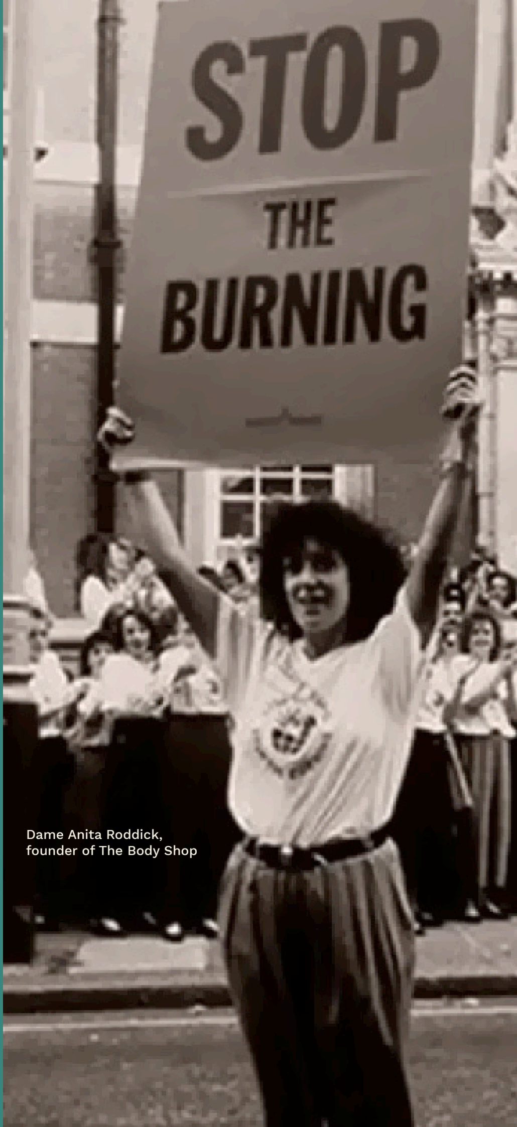
Dame Anita Roddick, founder of The Body Shop