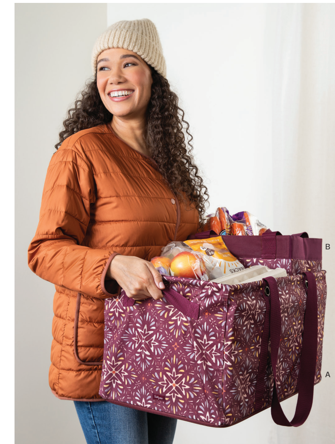
A. DELUXE UTILITY TOTE (4441) $64 B. ESSENTIAL STORAGE TOTE (4446) $42 Bundle and save! 2 ESSENTIAL STORAGE TOTES (A00M) $66

Check out mythirtyone.ca for the 9 top-selling styles made from this fabric, exclusively offered in new fall prints.