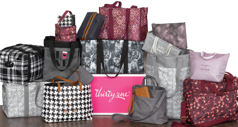
ULTIMATE #GOALGETTER KIT