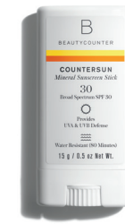
Mineral Sunscreen Stick SPF 30 $23 USD | 30 CAD$

This luxurious sunscreen lotion blends evenly and is water resistant. SKU 3042 / US ONLY 100 ml / 3.4 fl oz