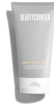
Clear Pore Cleanser $32 USD | 42 CAD$

Our signature SkinBalance Complex utilizes wintergreen and rosebay willow to mattify, clear breakouts, purify pores, and balance skin.