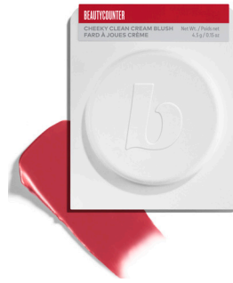
Cheeky Clean Cream Blush Refill $26 USD | 36 CAD$

How to refill: remove and recycle the empty refill (and swap it in for a new shade), and keep blushing it.