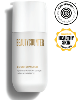
Countermatch Adaptive Moisture Lotion $54 USD | 70 CAD$

This lightweight lotion provides essential nutrition and oxygenation to keep skin soft and glowing for up to 24 hours of hydration.* SKU 100000458 / 100001025 50 ml / 1.7 fl oz