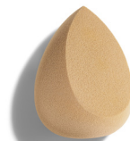
The Better Blender $22 USD | 29 CAD$

This triple-threat makeup sponge gives you a flawless finish from every angle.