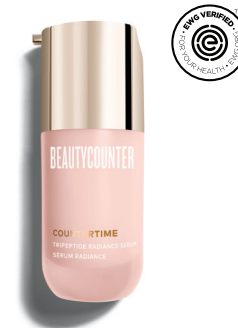
Countertime Tripeptide Radiance Serum $87 USD | 113 CAD$

This transformative, rejuvenating treatment visibly increases skin firmness and elasticity while reducing the appearance of fine lines and wrinkles.