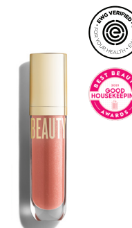
Beyond Gloss $32 USD | 39 CAD$

See page 7 for a list of shades. 40 ml / 1.35 fl oz