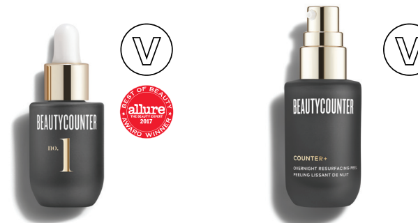
No. 1 Brightening Facial Oil $75 USD | 99 CAD$

Binchotan charcoal powder helps detoxify skin and absorb impurities (without dryness). This bar gives you a smoother, brighter complexion. SKU 100000439, 3027 85 g / 3.0 oz