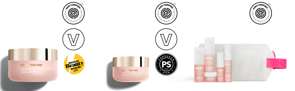
Tetrapeptide Supreme Cream $98 USD | 127 CAD$

This velvety, revitalizing cream improves skin’s barrier function and boosts hydration. SKU 100000241 50 ml / 1.7 fl oz