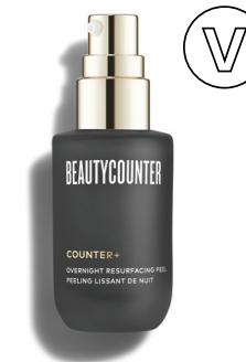
Counter+ Overnight Resurfacing Peel $72 USD | 94 CAD$

Featuring a proprietary multi-acid complex, this leave-on AHA/beta-hydroxy acid peel improves skin texture and boosts clarity without irritation or over-drying.