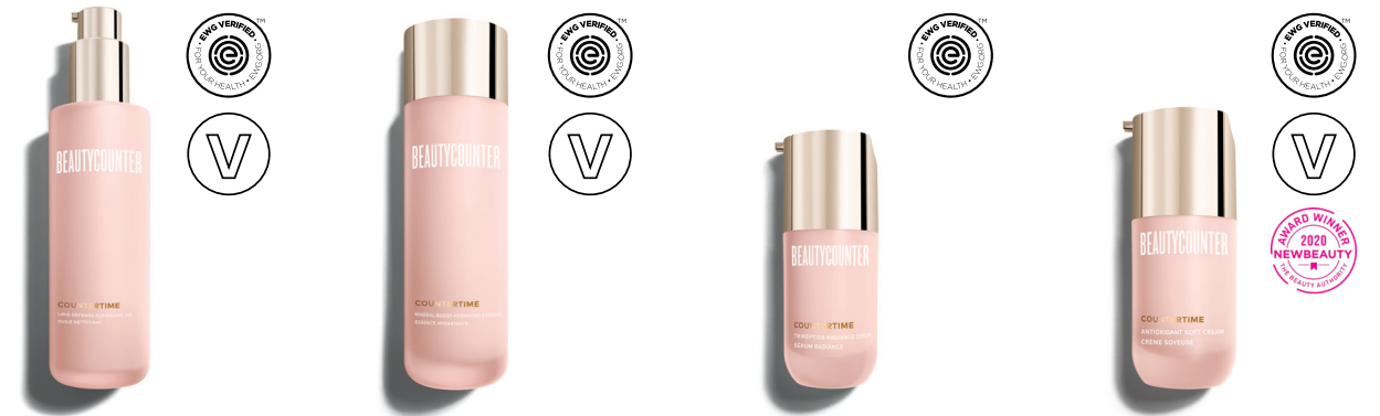
Lipid Defense Cleansing Oil $54 USD | 70 CAD$

Our Retinatural Complex consists of bakuchiol—which delivers age-defying skin-care results that are comparable to retinol (without potentially harmful side effects)—and Swiss alpine rose, which boosts skin’s antioxidant defense.