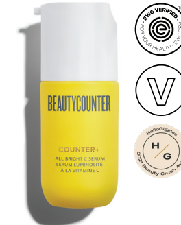
Counter+ All Bright C Serum $90 USD | 117 CAD$

This ultra-potent 10% blend of two forms of vitamin C instantly brightens skin and helps reduce the appearance of existing dark spots and protect against new ones.