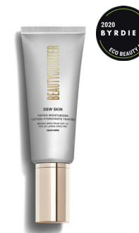
Dew Skin Tinted Moisturizer $50 USD | 62 CAD$

This lightweight lotion provides essential nutrition and oxygenation to keep skin soft and glowing for up to 24 hours of hydration.* SKU 100000458 / 100001025 50 ml / 1.7 fl oz