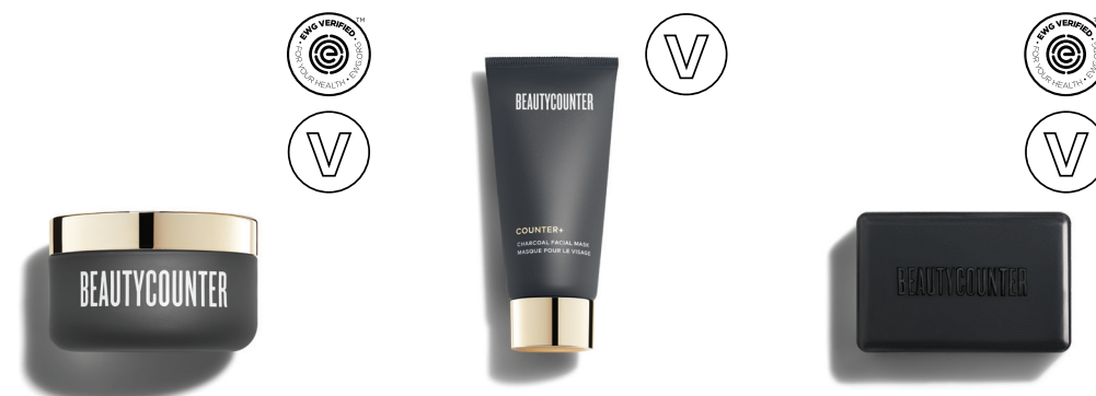
Lotus Glow Cleansing Balm $79 USD | 103 CAD$

We've transitioned even more Counter+ products to glass so they're more likely to have a second life as new products.