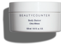
Body Butter in Citrus Mimosa $43 USD | 51 CAD$

Replenish moisture with shea butter and mongongo oil—leaving skin feeling soft and smooth. The formula blends easily into skin and absorbs quickly without feeling greasy. SKU 3037 130 ml / 4.4 fl oz