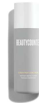
Instant Matte Toner $32 USD | 42 CAD$

This daily exfoliating cleanser effectively removes oil, makeup, and other impurities without harsh surfactants that can strip skin of moisture. SKU 100001024 150 ml / 5 fl oz