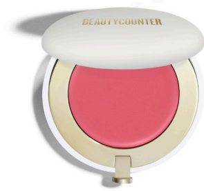
Cheeky Clean Cream Blush $42 USD | 55 CAD$

Versatile, multitasking, and mistake-proof, this silky cream color for cheeks (and lips) gives you a dewy, smooth finish thanks to skin-loving ingredients like squalane.