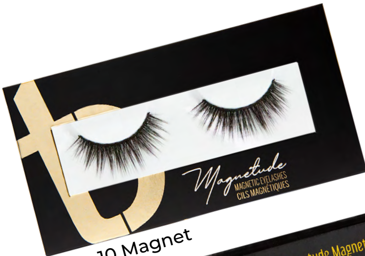
Core 10 Magnet

Our Magnetude ® Magnetic Eyelashes are the original and best magnetic eyelashes on the market with the strongest and lightest magnets available. All of our lashes are nickel-free and vegan using cruelty-free faux-mink nylon fibers.