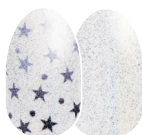
Under the Stars glitter