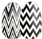
Keep Calm and Chevron