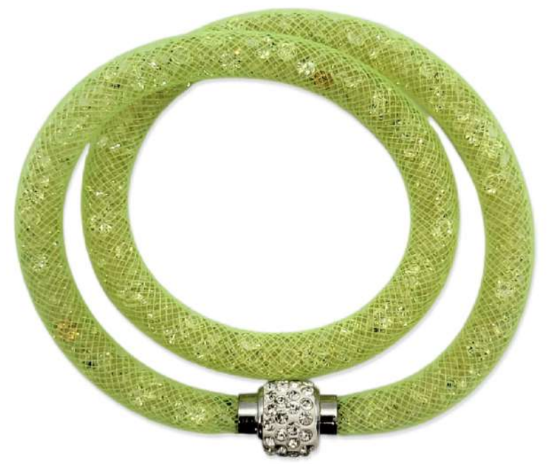
"Fairy Dust" $37.95