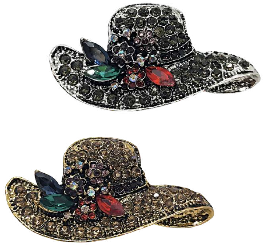
"Hat Lady" $41.95 - Cubic Zirconia