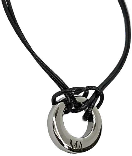
"Circle Of Trust" $59.95 - Stainless Steel