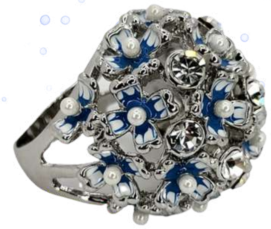
"Winter Princess" $69.95 - 3A Cubic Zirconia