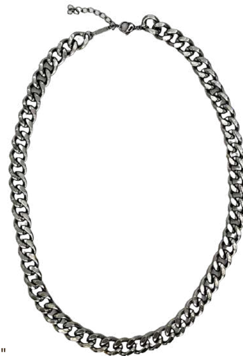
"Drippin Links" $69.95 - Stainless Steel