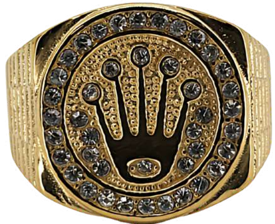
"Champions" $59.95 - Titanium - 18K Gold Plated -3A Cubic Zirconia