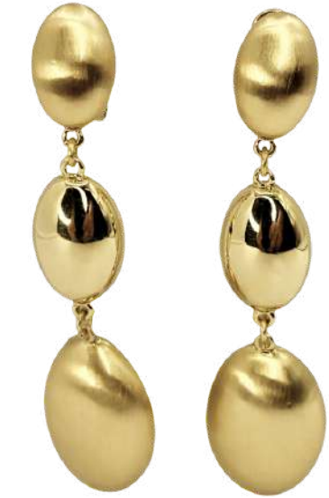
"Brush It Off - Set" $179.95