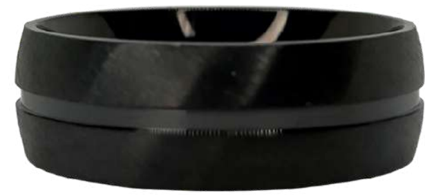
"Back In Black" $44.95