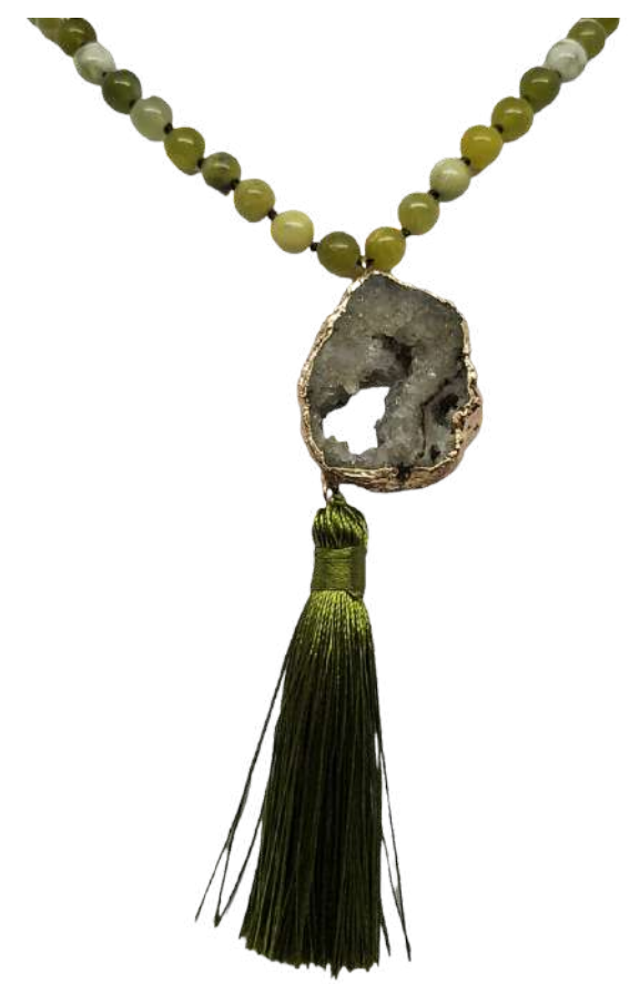
"My Gem" $79.95 - Quartz