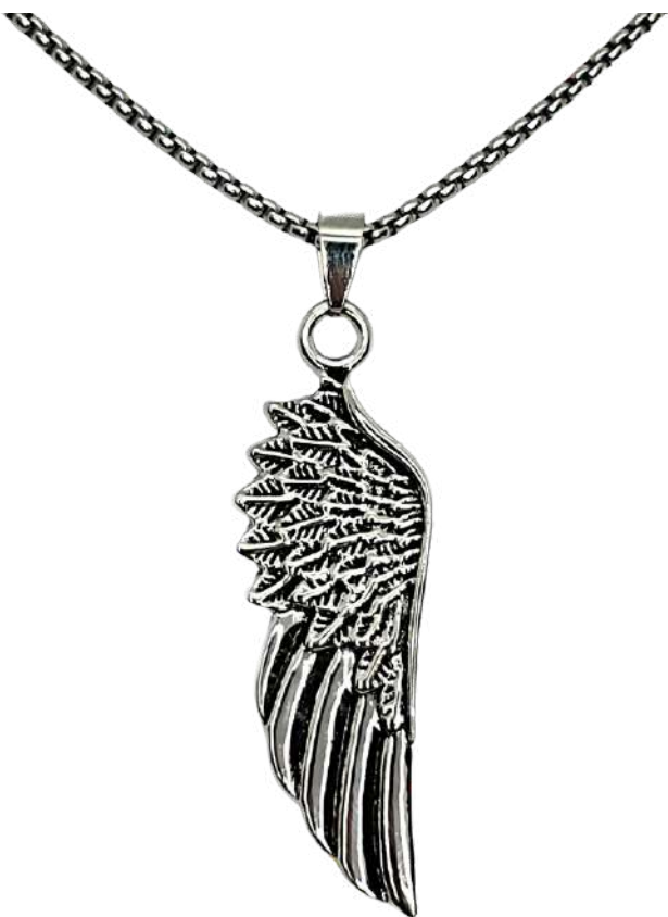
"Alpha" $59.95 - Stainless Steel