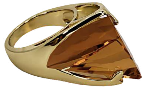
"Ring Pop" $97.95 - European Glass