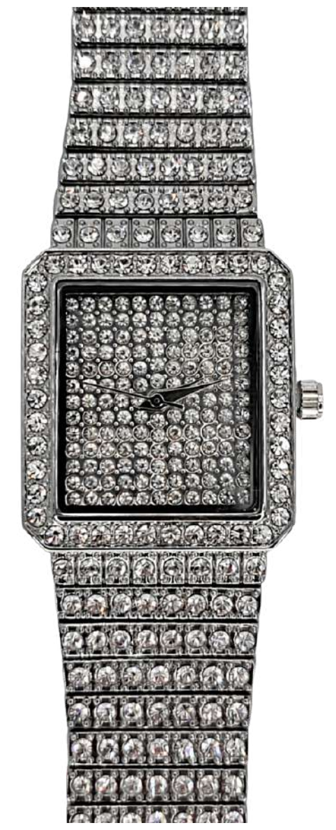
"Madison Avenue" $229.95 - Stainless Steel - 3A Cubic Zirconia -Waterproof