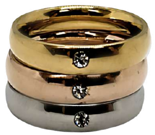
"Trio" - 3 Pack $69.95 - Stainless Steel