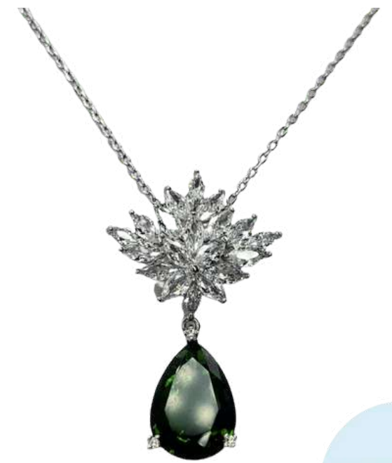
"Feeling Proper" $69.95 - 3A Cubic Zirconia