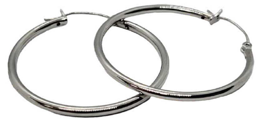
"Solid" $59.95 - Sterling Silver - Rhodium Plated 35mm