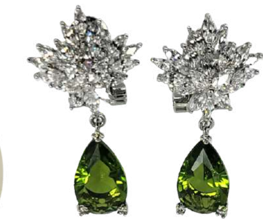
"Feeling Proper" $79.95 - 3A Cubic Zirconia