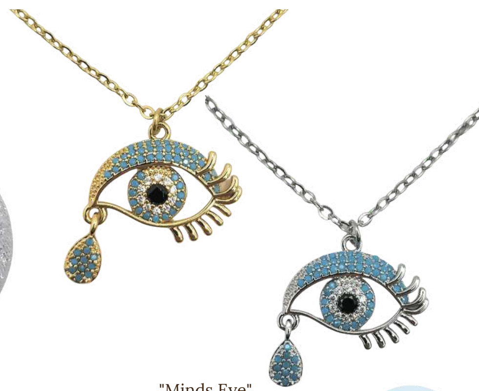
"Minds Eye" $49.95 - Stainless Steel - 3A Cubic Zirconia