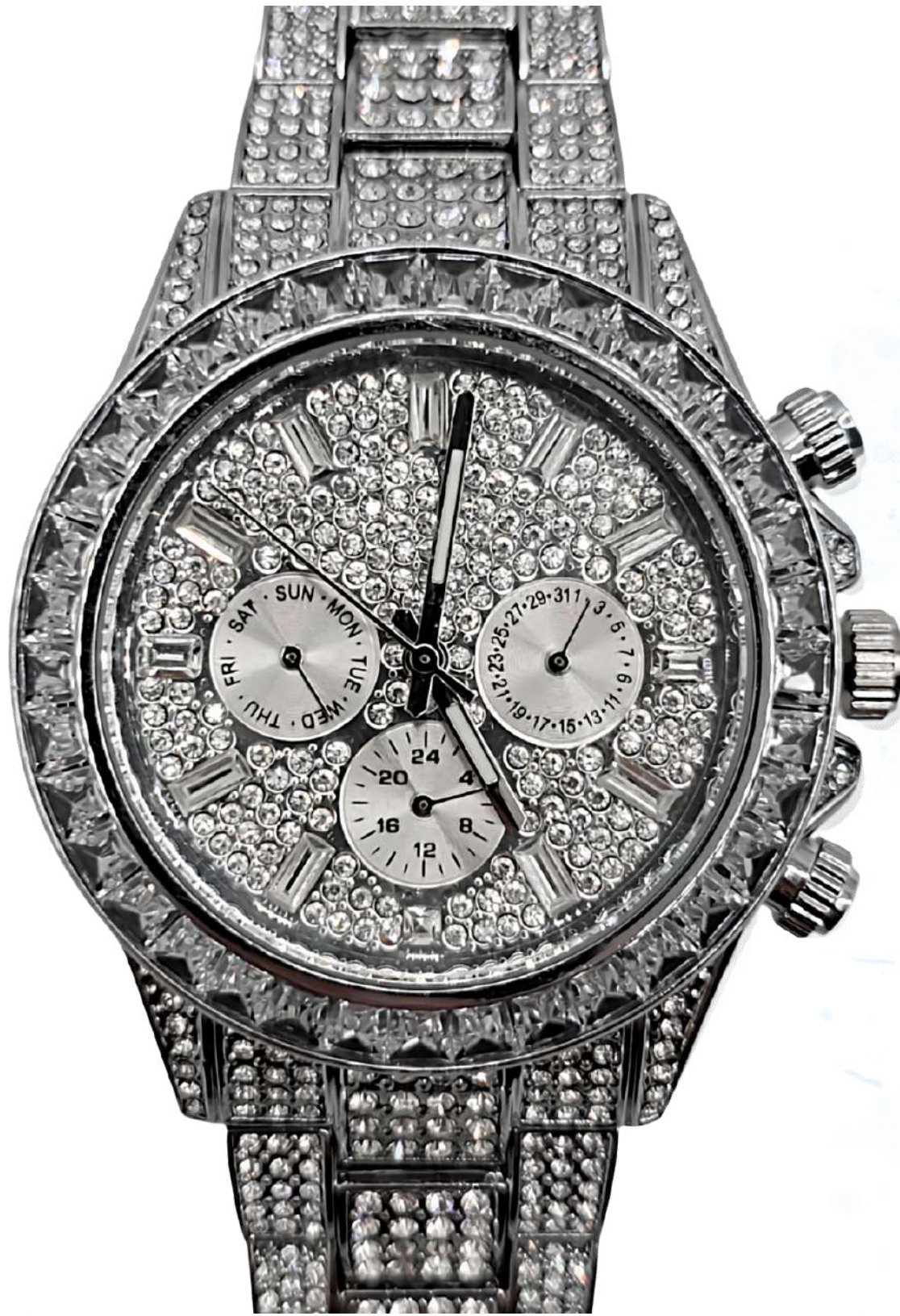
"Prime Time" $329.95 - Stainless Steel - 3A Cubic Zirconia