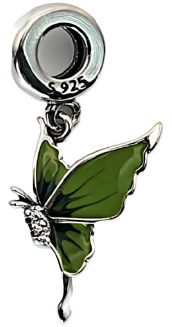
"Butterfly With Me" $47.95 - Sterling Silver