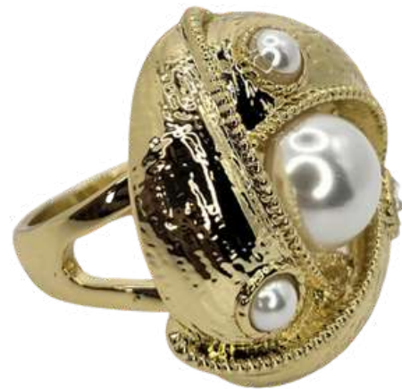
"Whirlpool" $65.95 - 18K Gold Plated