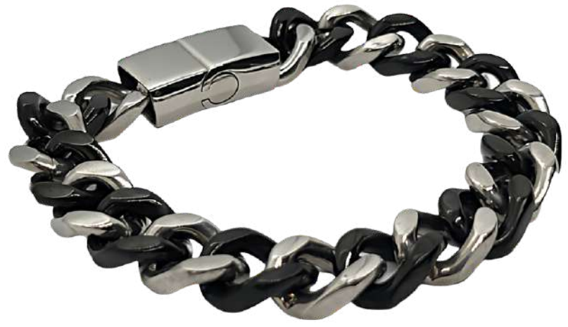
"Off The Chain" $86.95 - Titanium