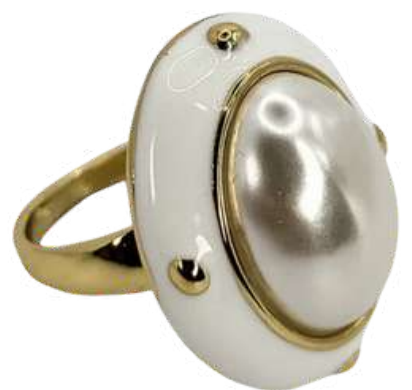
"Queens Order" $49.95 - Platinum Plated - 18K Gold Plated