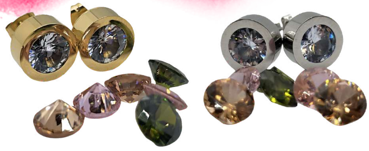
"Pick Me" $54.95 - Stainless Steel