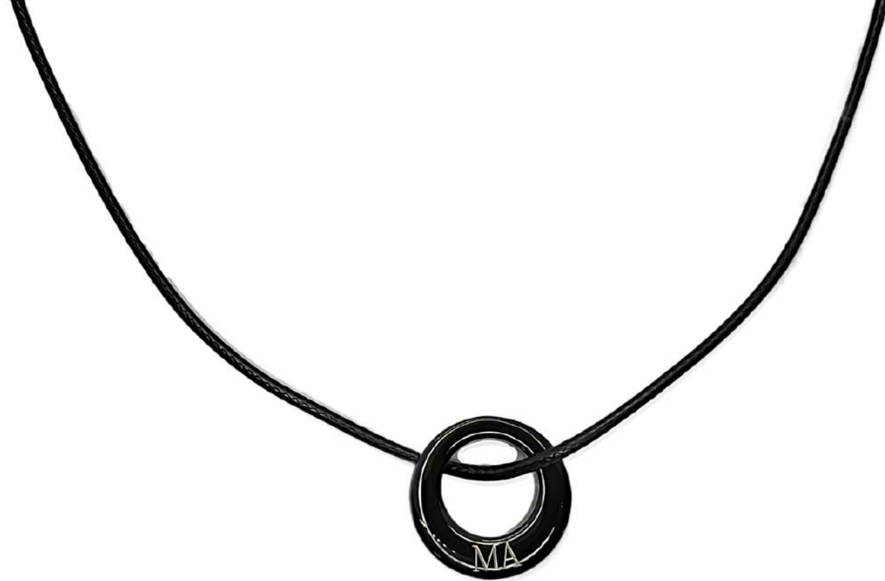
"Circle Of Trust" $64.95 - Stainless Steel