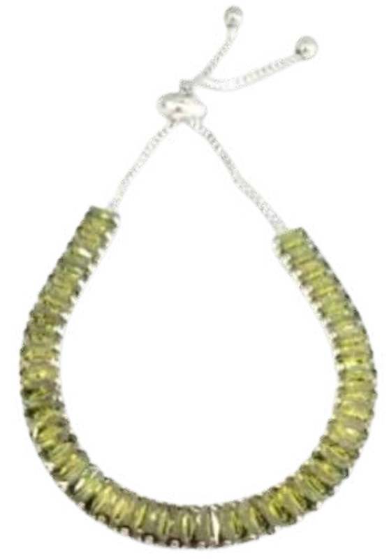
"Carnival Of Colour" $49.95