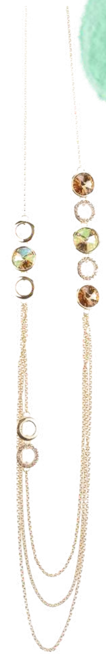
"Forever" $87.95 - Austrian Crystal