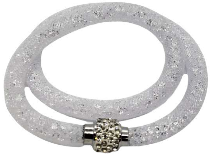
"Fairy Dust" $37.95