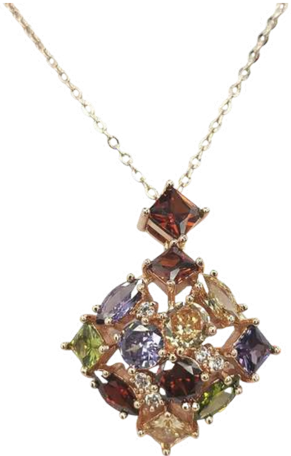
"Samba!" $69.95 - 3A Cubic Zirconia