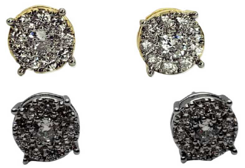
"Iced Out" $59.95 - 3A Cubic Zirconia