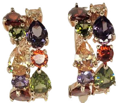
"Samba!" $71.95 - 3A Cubic Zirconia