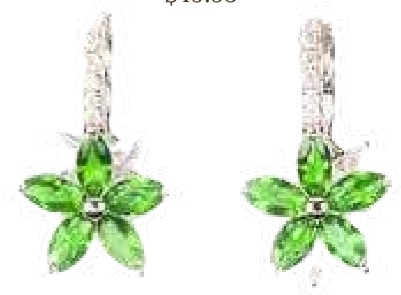
"Blossom" $47.95 - 3A Cubic Zirconia