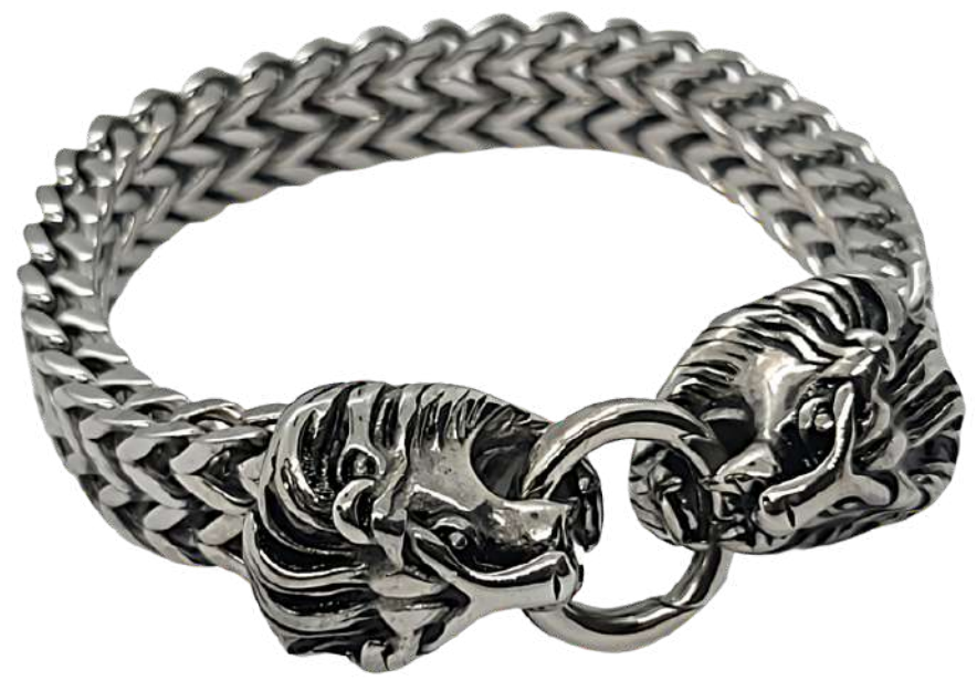
"Aslan" $109.95 - Stainless Steel