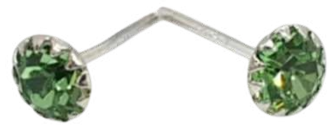
"Birthstone - AUG" $41.95 - Sterling Silver