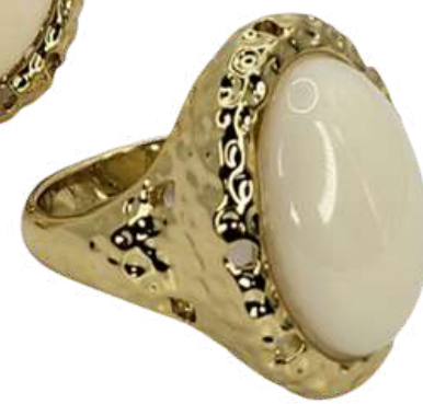
"Madam Kensington" - Set $98.95 - 18K Gold Plated - Resin