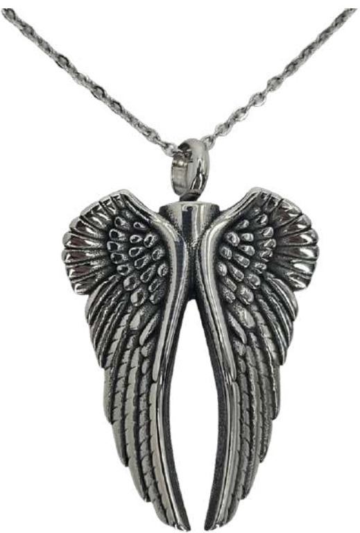
"Fly Up High" $72.95 - Titanium