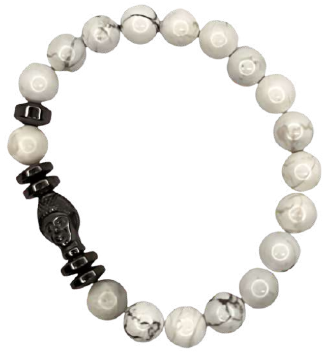
"Floki" $47.95 - Turquoise