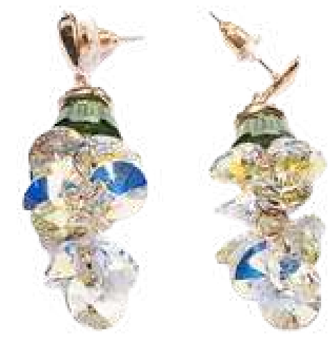
"Green Allure" $86.95 - Austrian Crystal