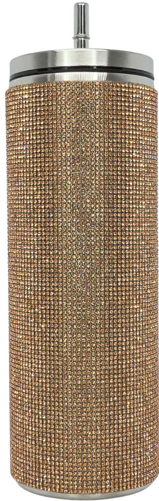
"Bling Frappe" $79.95 - Stainless Steel