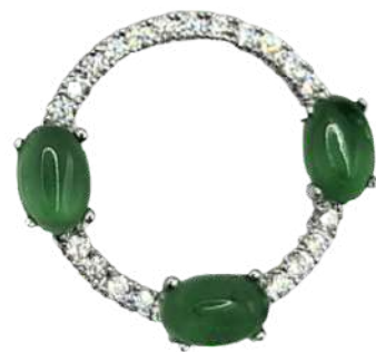
"Green Meadow" $57.95 - 3A Cubic Zirconia