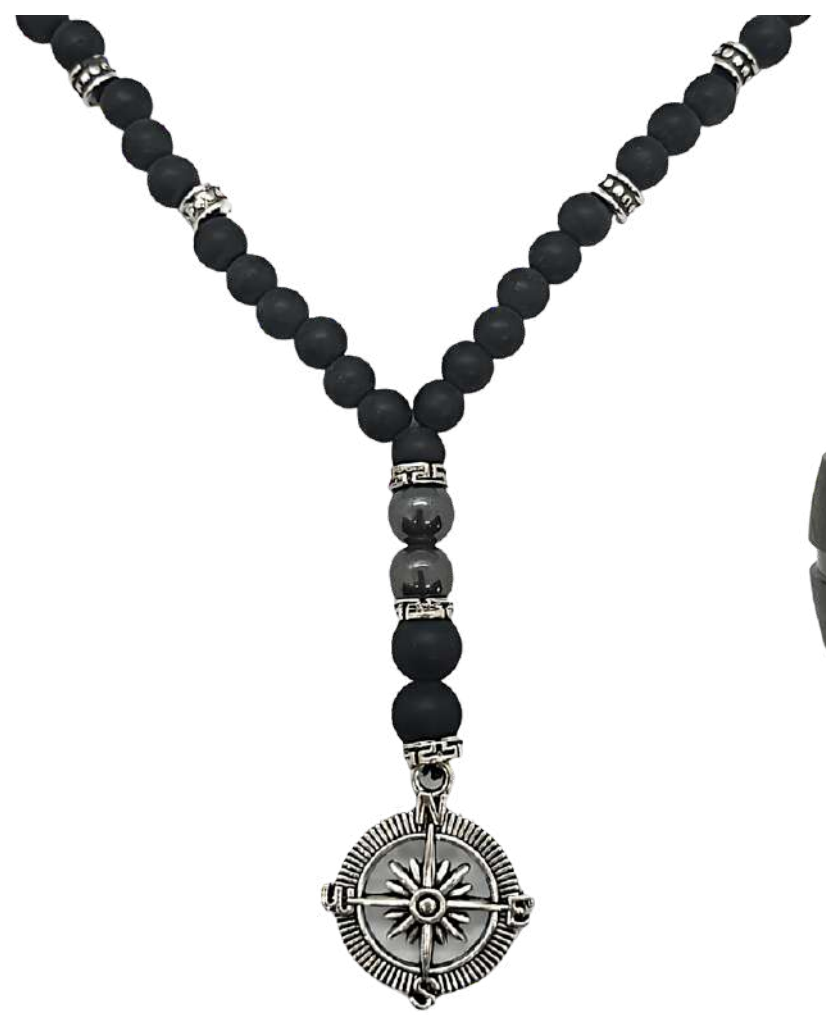
"Navigate" $59.95 - Natural Stone -60cm in length