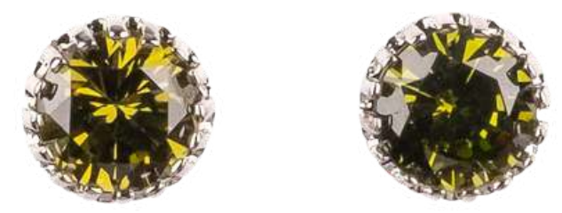
"Diana" $51.95 - 3A Cubic Zirconia