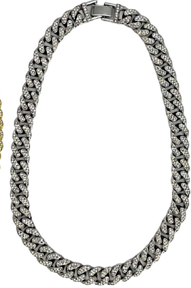
"Heavy Flex" $119.95 - Stainless Steel - 3A Cubic Zirconia Available in 18", 20" & 24"