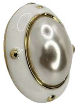
"Queens Order" $49.95 - Platinum Plated - 18K Gold Plated