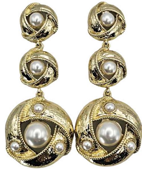
"Whirlpool" $59.95 - 18K Gold Plated