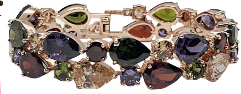
"Samba" $179.95 - 3A Cubic Zirconia