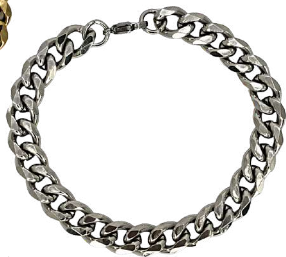
"Drippin Links" $59.95 - $62.95 - Stainless Steel Available in sizes 8" & 9"